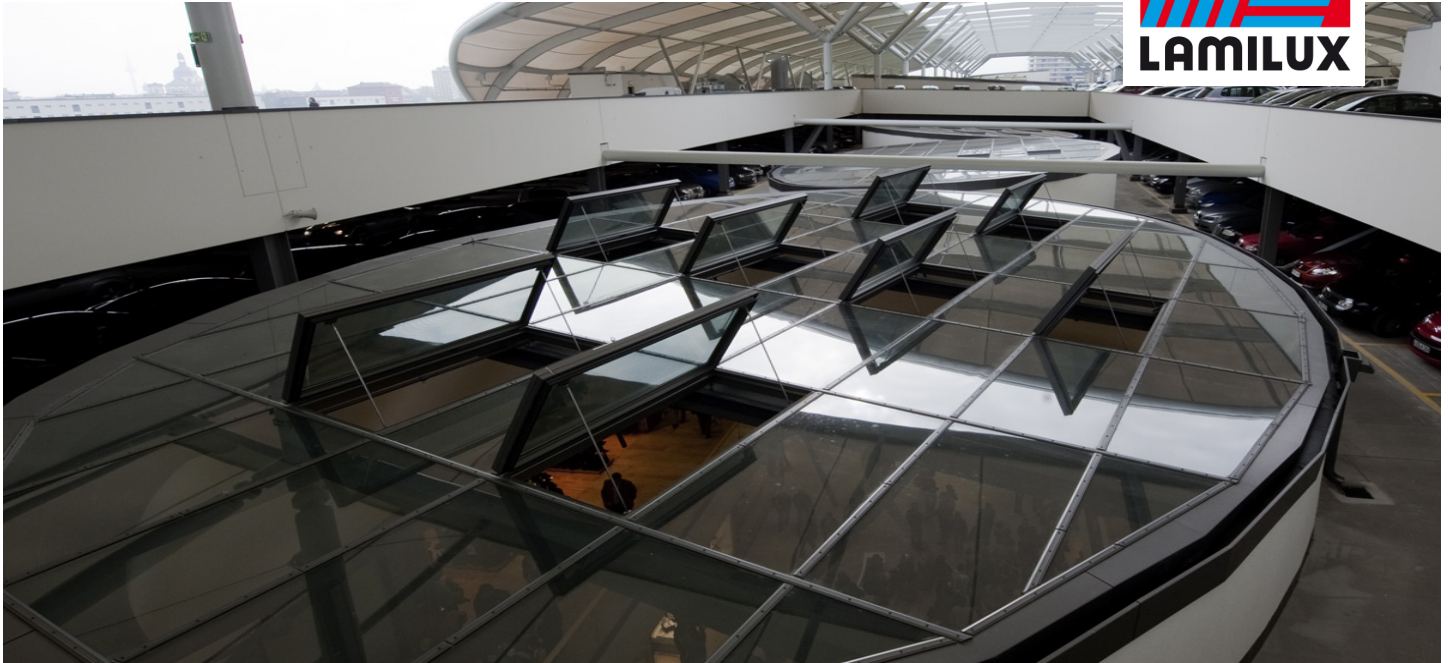
Rhein-Galerie, Ludwigshafen, Germany