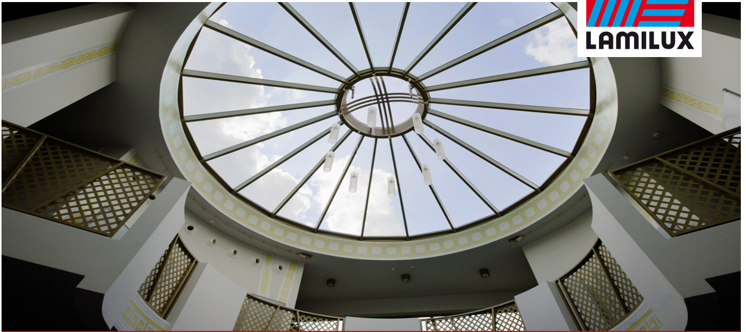
Embassy of Kazakhstan, Berlin