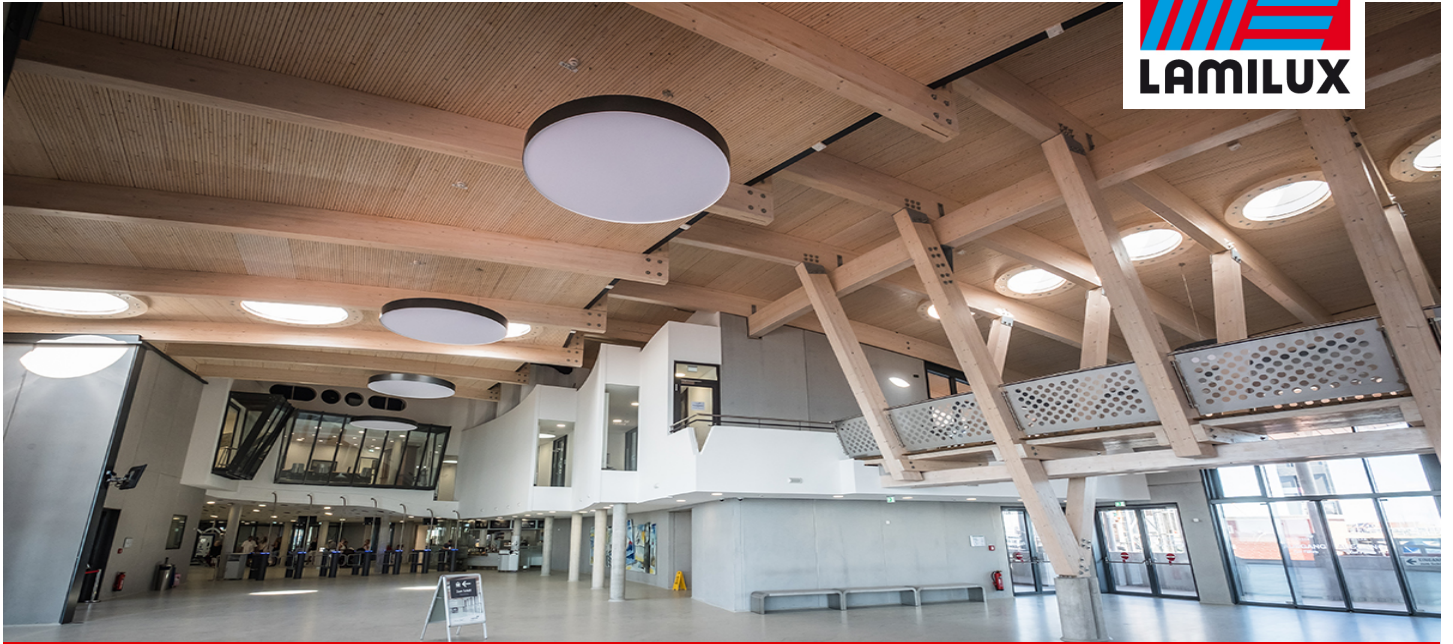
Harbour Terminal "Hafendüne", Norderney (Germany)