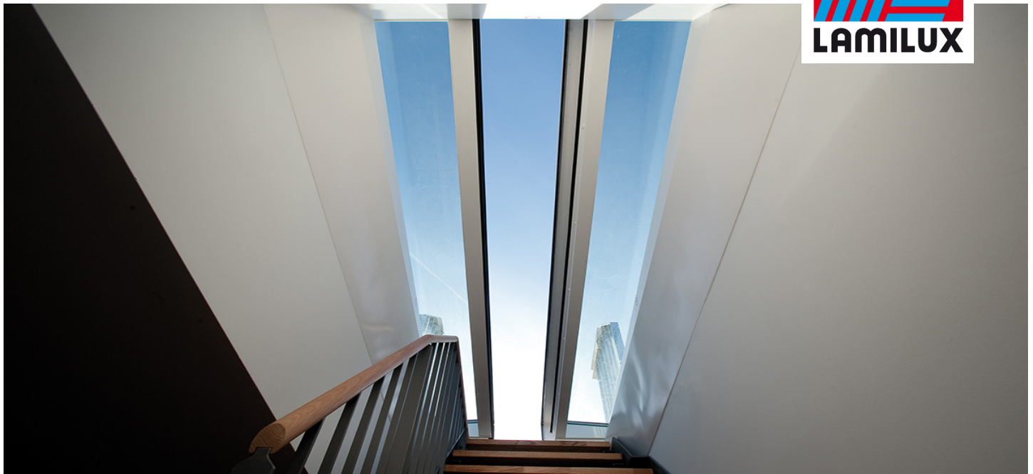
Top floor apartment in the centre of Berlin