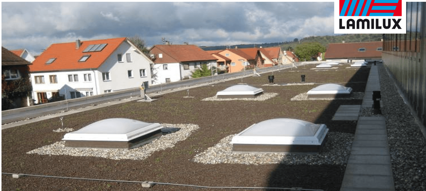
Multipurpose Hall Schillerhalle, Dettingen