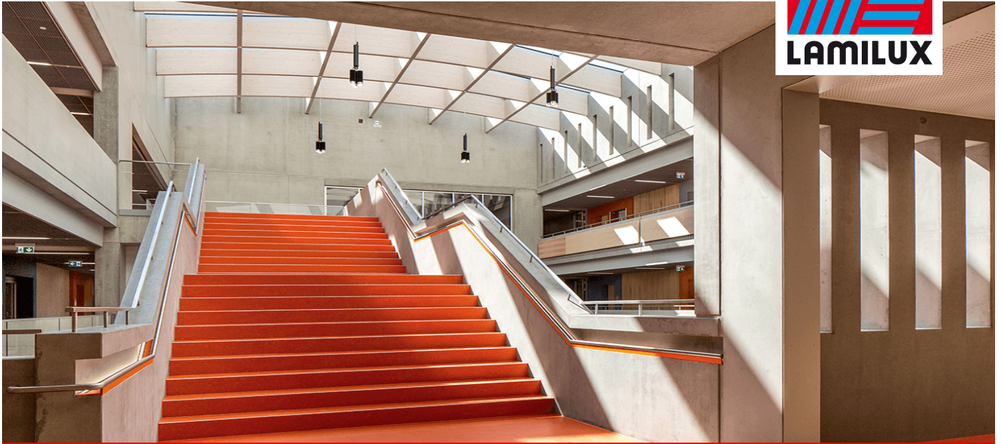
Willibald-Gluck Secondary School, Neumarkt i.d. OPf.